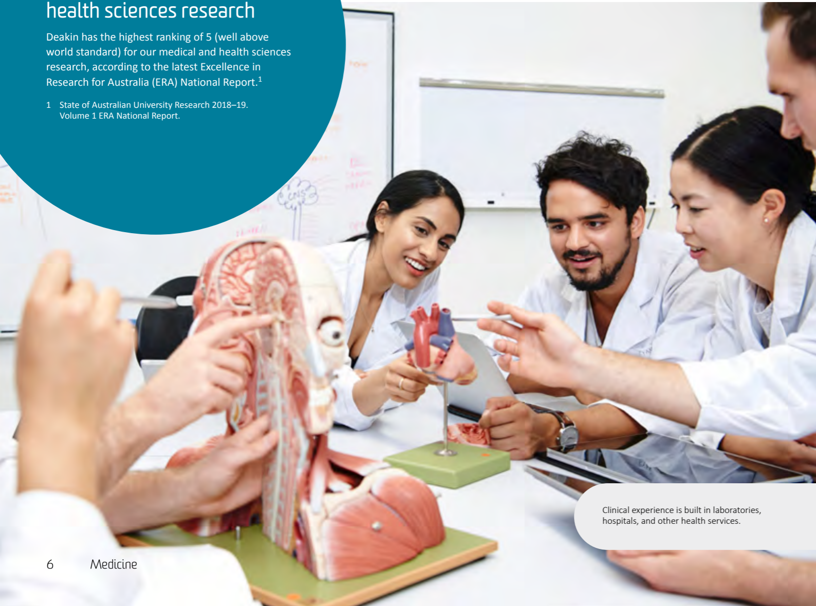
Clinical experience is built in laboratories, hospitals, and other health services.