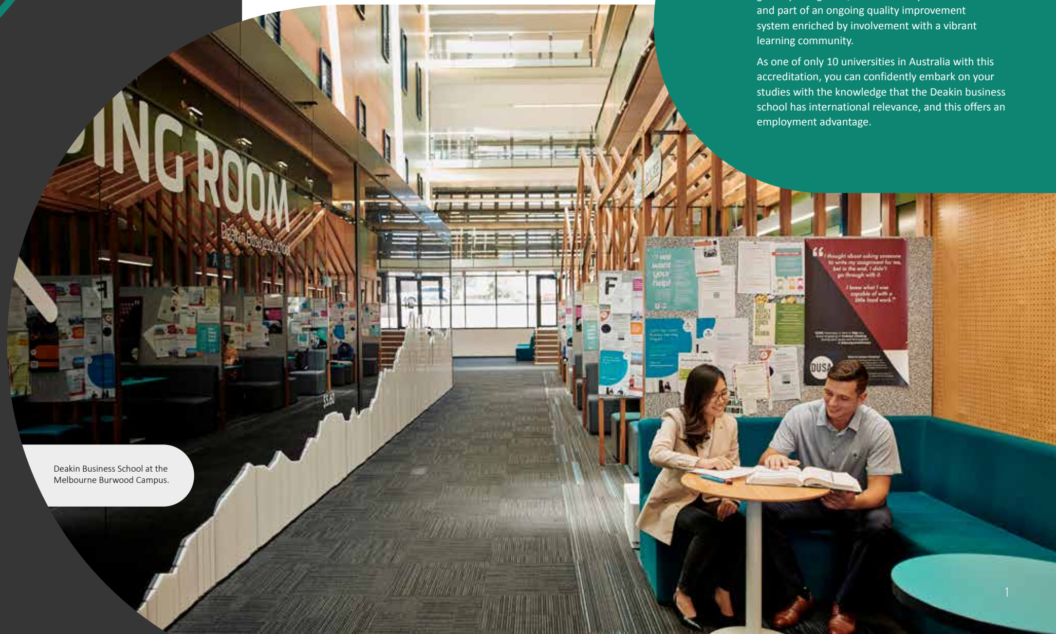
Deakin Business School at the Melbourne Burwood Campus.

As one of only 10 universities in Australia with this accreditation, you can confidently embark on your studies with the knowledge that the Deakin business school has international relevance, and this offers an employment advantage.