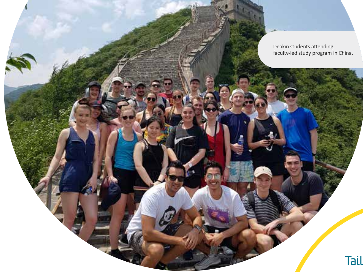
Deakin students attending faculty-led study program in China.