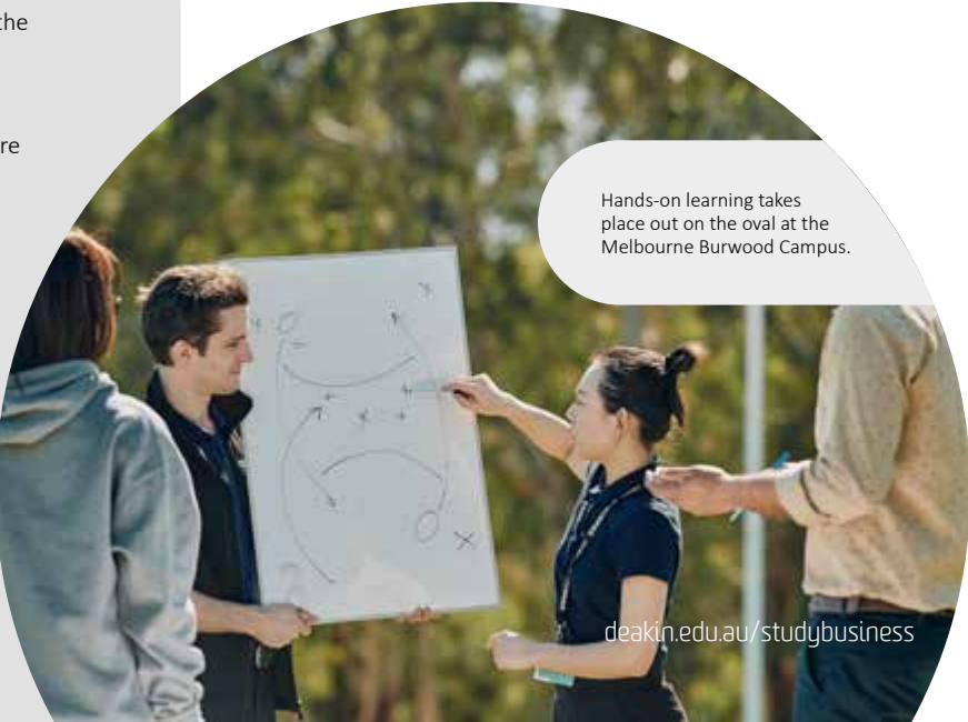
Hands-on learning takes place out on the oval at the Melbourne Burwood Campus.

deakin.edu.au/course/bachelor-sport-development